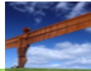
Angel of the North