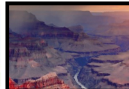
Grand Canyon (AZ)