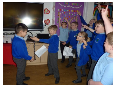
'Interviewing Nelson Mandela'