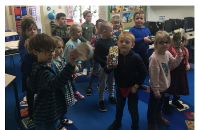
Presentation Day Squirrels rehearsing for Oscars Night!